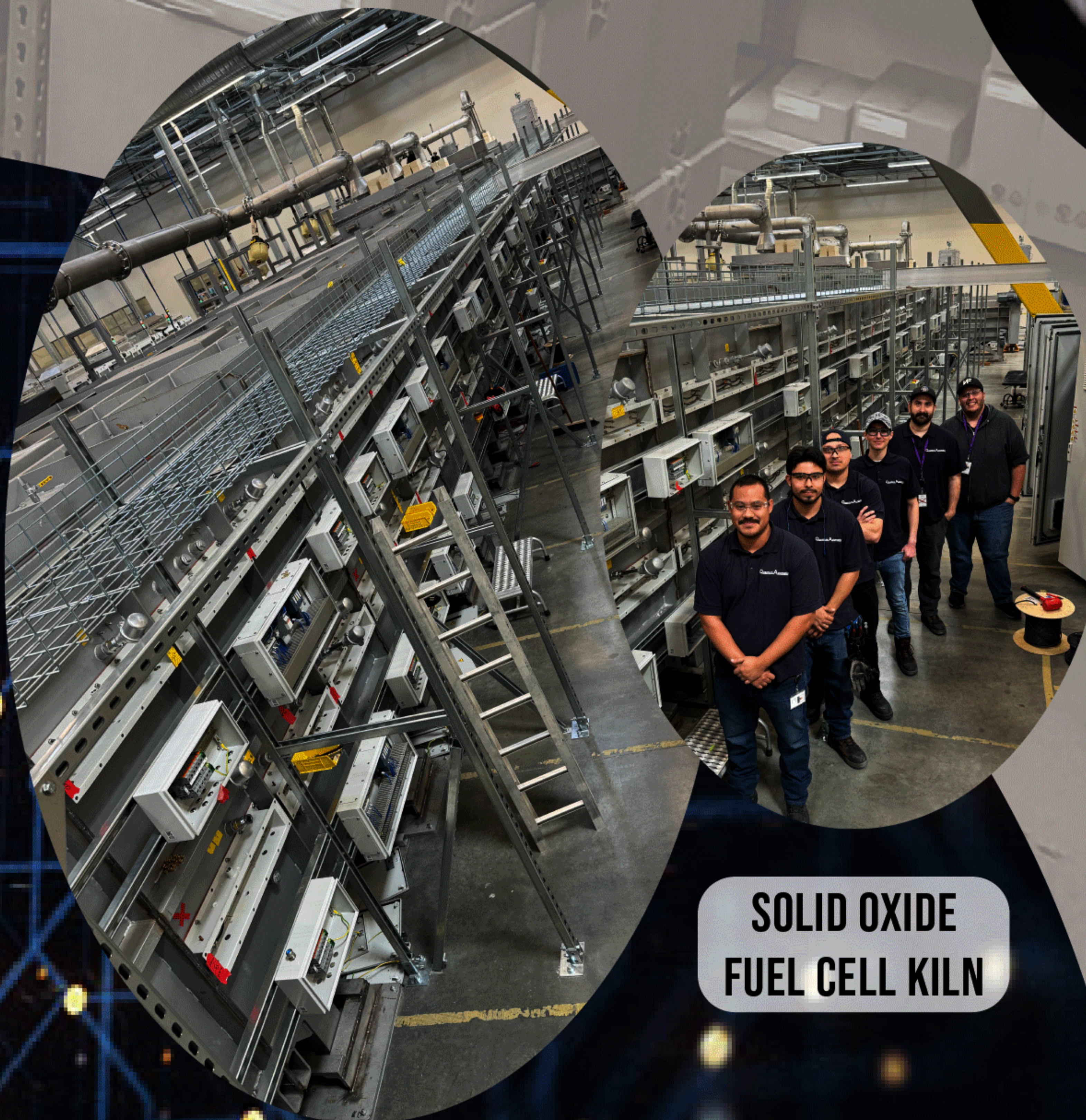
SOLID OXIDE FUEL CELL KILN