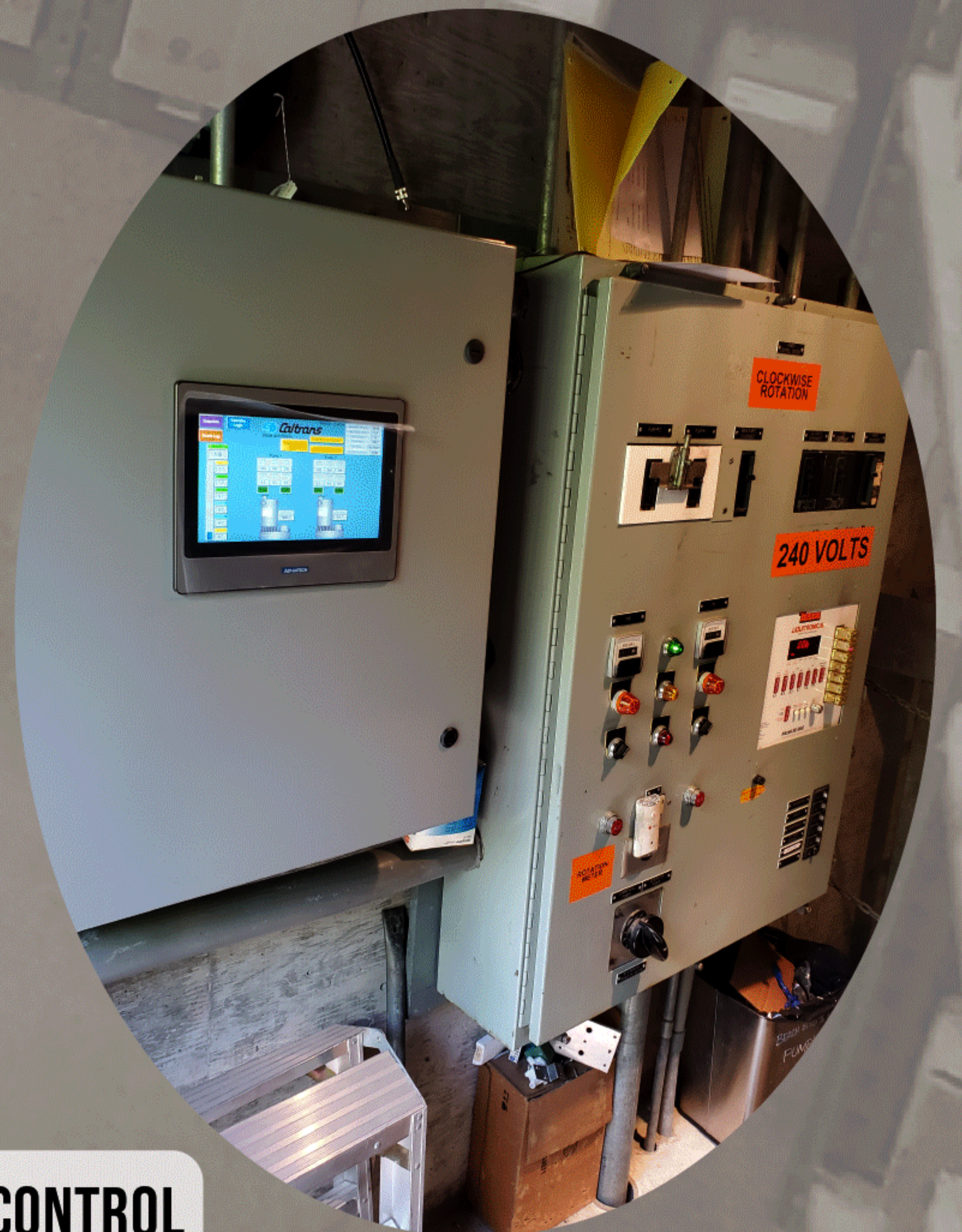
FREWAY FLOOD CONTROL