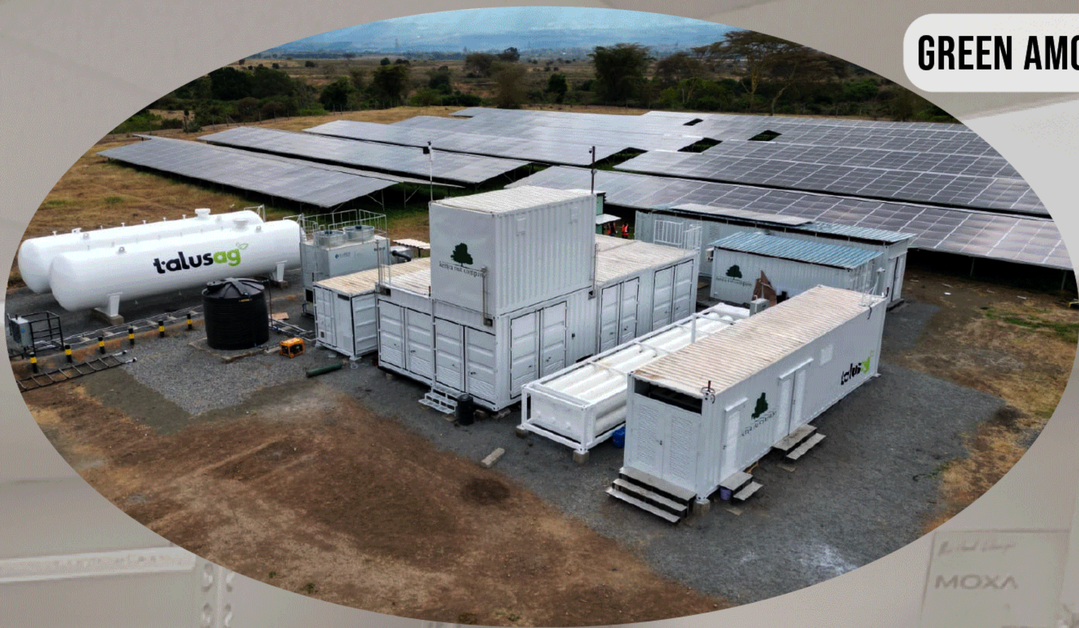
GREEN AMONIA PROJECT